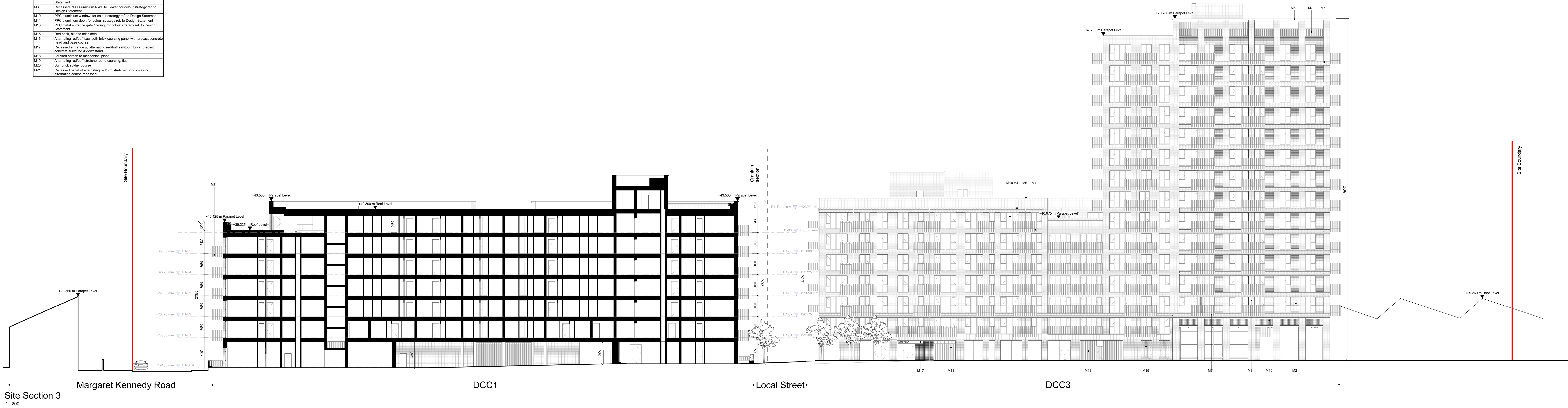
Site Section 3 1 : 200